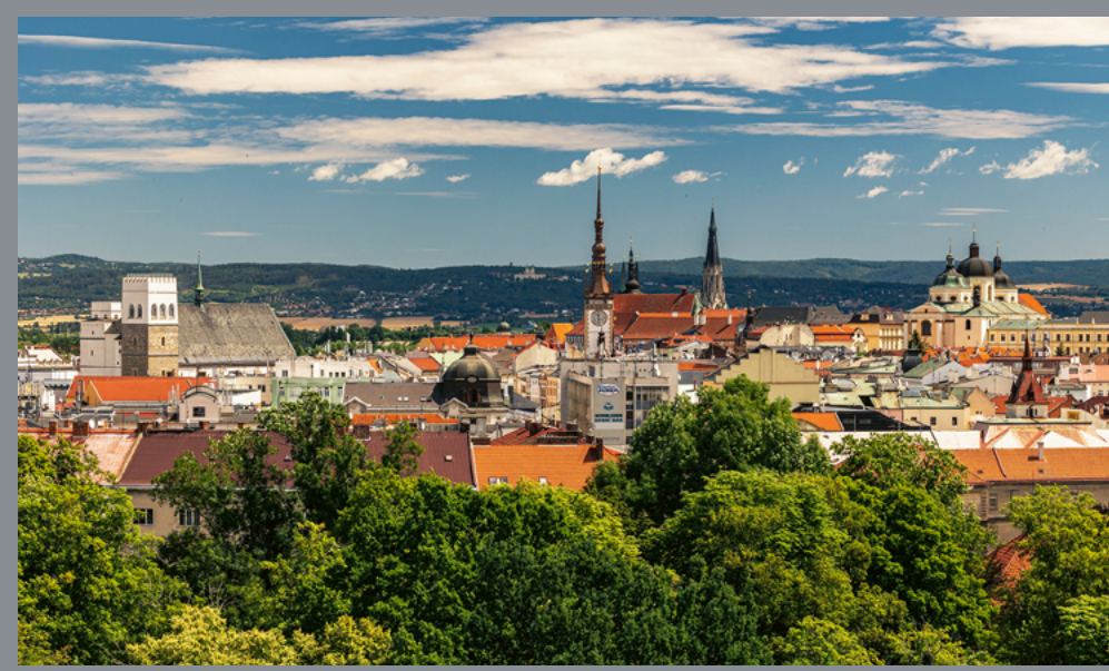
Panorama of the Olomouc historical centre