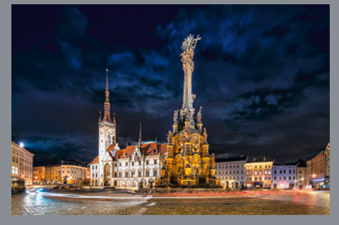
Upper Square with Townhall and the Holy Trinity Column